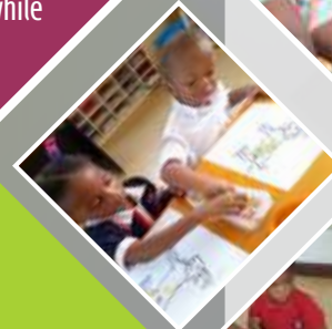
Art & craft